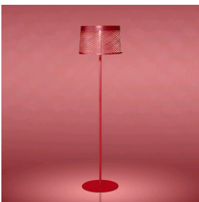
Twiggy Grid Lettura